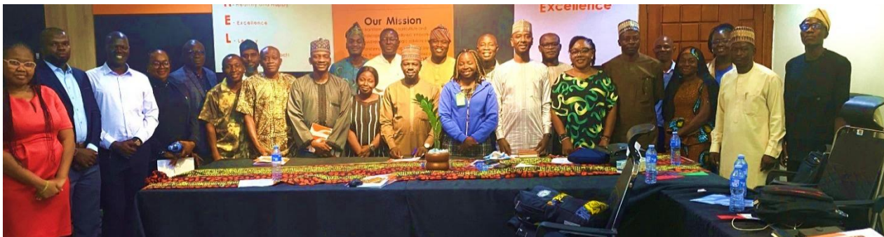
Photo 17: Group photograph of participants after day 2 of the workshop.

To strengthen Nigeria's seed aid ecosystem and enhance resilience during crises, stakeholders emphasised the following urgent priorities: