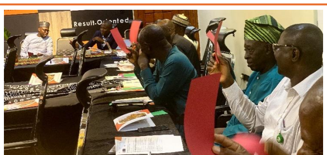
Photo 6: Stakeholders voting during polling sessions at the workshop