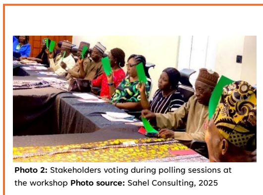
Photo 2: Stakeholders voting during polling sessions at the workshop

Stakeholders unanimously agreed (as shown by all raising green cards, photo 2) that the 10P were relevant and needed in the Nigerian context. This overwhelming support underscored the timeliness of the dialogue and reinforced the importance of contextualising and officially endorsing the framework to guide seed aid responses in strengthening the resilience of the country's seed system.