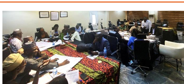
Photo 11: Full view of stakeholders deliberating during the strategy development activity.

Nigeria's emergency seed responses will significantly improve if SSSA becomes standard practice. Stakeholders highlighted a persistent lack of standardised tools, limited capacity, and the complex realities of displacement, conflict, and political interference. Specific locations face cyclical crises in which communities are uprooted and traditional seed channels collapse, yet responders often lack a structured method for diagnosing needs. The key actors include NEMA, NGOs, humanitarian agencies, state ministries, and ADPs, all of whom require access to standard SSSA tools, funding for field assessments, digital data systems, and refresher training for operators.