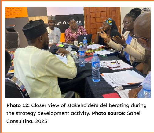
Photo 12: Closer view of stakeholders deliberating during the strategy development activity.