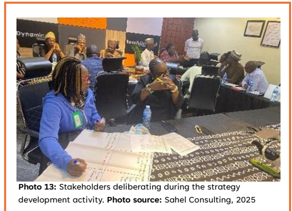
Photo 13: Stakeholders deliberating during the strategy development activity.

A poor seed response that delivers substandard seed worsens a crisis. Stakeholders highlighted non-seed companies infiltrating supply systems, weak coordination, and the politicisation of seed distribution. Ensuring quality begins with enforcing the rule that only NASC-registered companies and certified producers supply seed during emergencies. This entails updated procurement specifications, verified supplier lists, and clear penalties. Coordination must be strengthened by prioritising quality control at the centre of seed aid delivery, ensuring that all actors follow uniform quality protocols and use standard reporting tools.