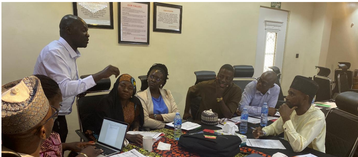
Photo 10: Stakeholders deliberating during the strategy development activity