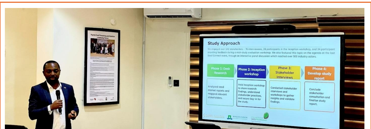
Photo 1: Chinedu Agbara, Sahel Consulting, during a context-setting presentation on why the 10P matters for Nigeria.

The methodology combined presentations (10P framework, institutional seed market assessment), panel discussions with field practitioners, interactive debates on policy propositions, breakout groups analysing barriers and developing strategies, and plenary sessions securing consensus and commitments on the way forward.