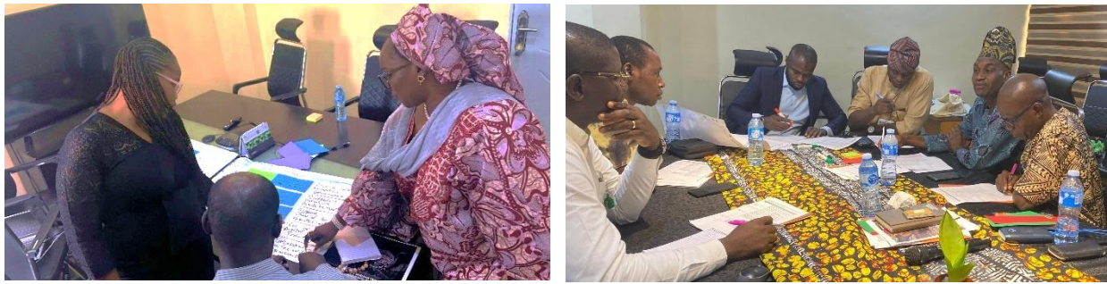
Photo 15 & 16: Stakeholders deliberating during the group activity.

The workshop concluded with a clear alignment on the need to strengthen coordination and empower farmers across all stages of the seed system. Key outcomes include: