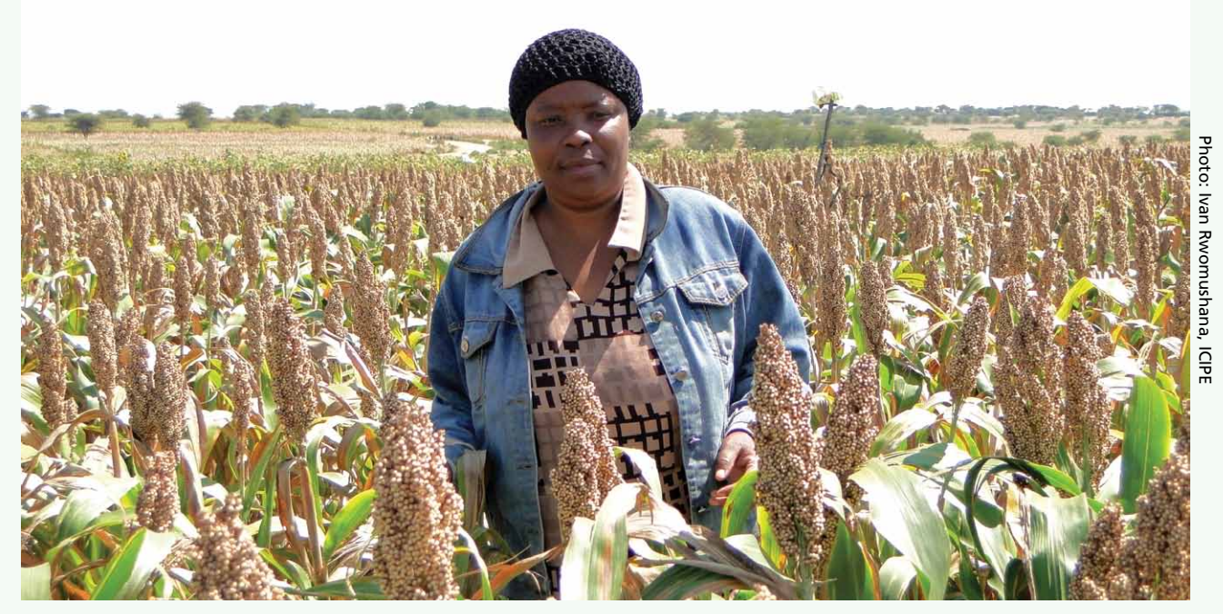
Small seed business accessing foundation seed from research to produce QDS of improved sorghum for sale to neighbouring vallages at Singida, Tanzania

districts - Chipata, Lundazi and Vubwi - each with two locations (camps). In this study, 50 bean-producing households from each agricultural extension camp were targeted for interviews. A stratified random sampling of willing households was carried out by bean growers, who had themselves been selected from each camp by the agricultural extension camp officer. In total, 300 household interviews were conducted face-to-face. Farmers were made aware beforehand of the objectives of the survey through the agricultural camp extension officers. The interviews were carried out to collect baseline household data about bean production and related activities in the targeted areas prior to the study, in order to achieve a meaningful analysis. The third component of the study comprised two focus group discussions that were conducted with farmers and camp agricultural extension officers in Chadzombe and Chiwoko agricultural extension camps, in Chadiza