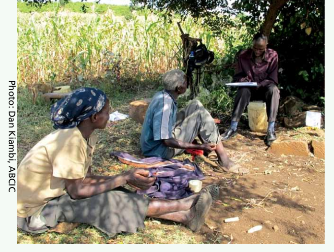
Farmers providing feedback to researcher on genebank material

varietal selection is needed for the development of an effective two-way varietal information delivery mechanism. The crowdsourcing approach provides information that is useful to both farmers and seed and input suppliers. More research may be needed to develop the approach into a platform that serves the two-sided market for agricultural technology (Minneboo, 2015). The study has clearly demonstrated that the crowdsourcing approach is practical and largely effective in the dissemination and diffusion of varieties (through seed) in local communities. The crowdsourcing approach and the practice of distributing seed packets could be suitable for both the formal and informal seed systems.